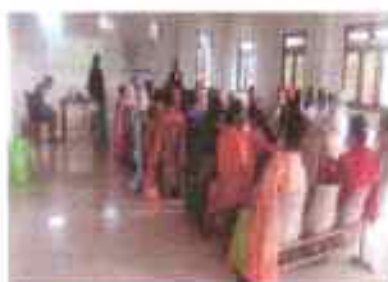
Awareness meeting on domestic violence

On 24 th Nov 2019 with ICDS workers Bidynagar and PESCH conducted domestic violence issues and women rights at JNN conference hall Jiribam. In the meeting 27 persons of Bidyanagar women participated. On 12 th and 15 th February 2020 awareness meeting on women rights on land was conducted at Chingkao and Oinamlong village Tousem Sub-Division, Tamenglong. In the meetings 45 women and church leaders participated.