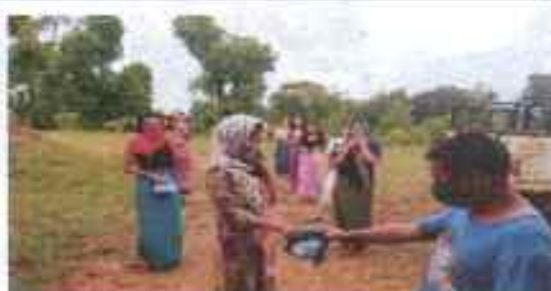
Menstrual pad kits distributed to 35 girls at Aben