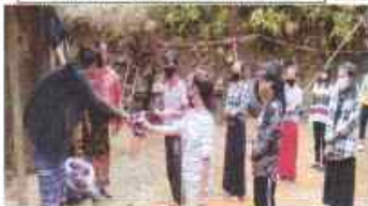
Menstrual pad kits distributed to Tousem 80 girls