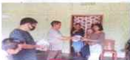
Awareness to 50 girls of New Allpur Jiribam on

The Moon Catcher pad kits provides free reusable, washable menstrual pad kits" that can be worn without underwear for girls. These pads provide a way for girls to stay at home during lock down while menstruating, giving them a greater chance of healthy hygiene. It benefited to 1000 girls from Jiribam students from Jiribam and Tousem blocks of Manipur and Cachar Assam