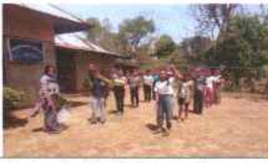
Menstrual pad kits distributed to girls Longchai