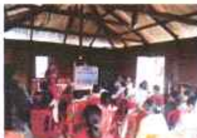
Women rights awareness at Chingkao