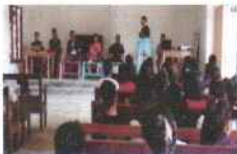
Awareness at Secondary school Jiribam