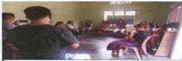
Menstrual pad kits distributed to 30 girls New Allpur