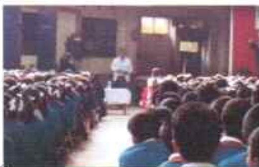
Awareness given to UBS students by DC Tamenglong