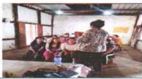
Awareness at Aben junior high school