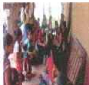
Women land rights meeting